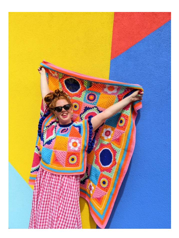
Remember to share and tag your makes @KKATIEJONESKNIT @KNITSIRDAR AND USE #MIYKATIEJONES

WOOOHOOOO you have created your Day Tripper CAL Hack- now go ant match your picnic blanket in style!!