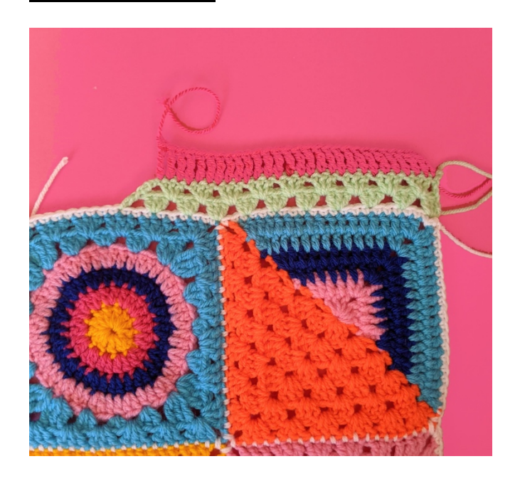
REPEAT: Mirror on both sides of panel

ROW 1: In Pistachio, Join in top edge corner CH Sp, CH3, TR2 into same CH Sp, (miss 2, TR3 into next St) X 9, miss 2, TR1 into next St