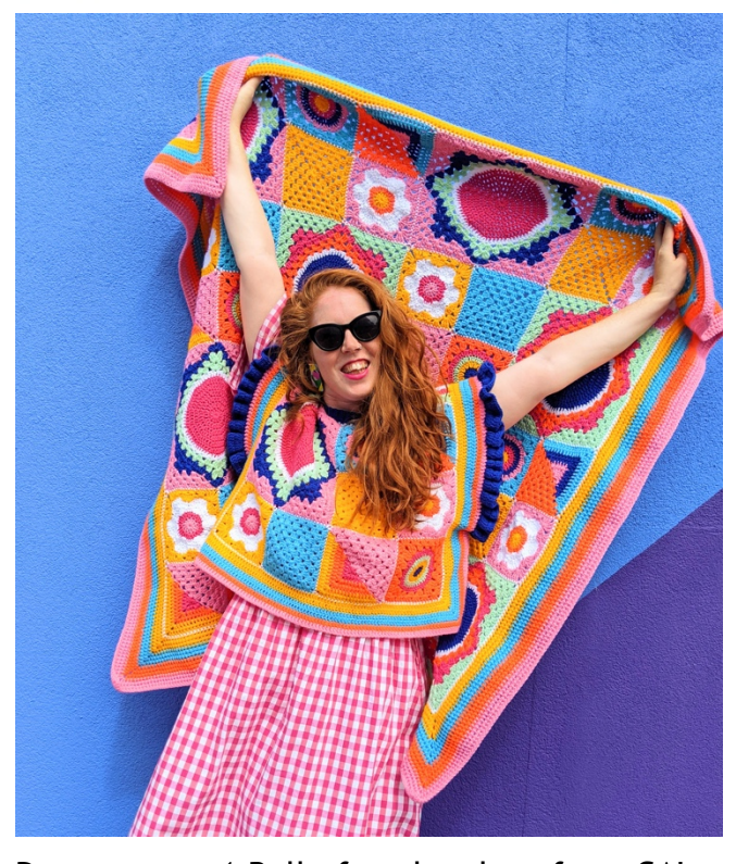
Pattern uses 1 Ball of each colour from CAL Sirdar/ Hayfield Bonus 100g Balls (8 colours)