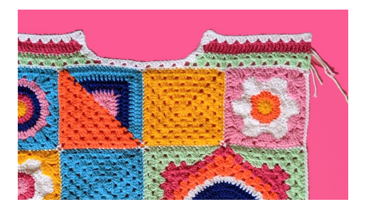
Work across entire top edge

ROW 4: Join in White at top right hand edge. (CH3, TR2 into same St), (Miss 2, TR3 into same St) X 8, CH2, 3TR into same ST,